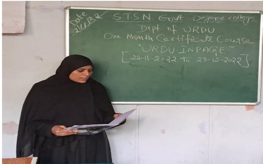
Conducting Exam for the students of Certificate course.